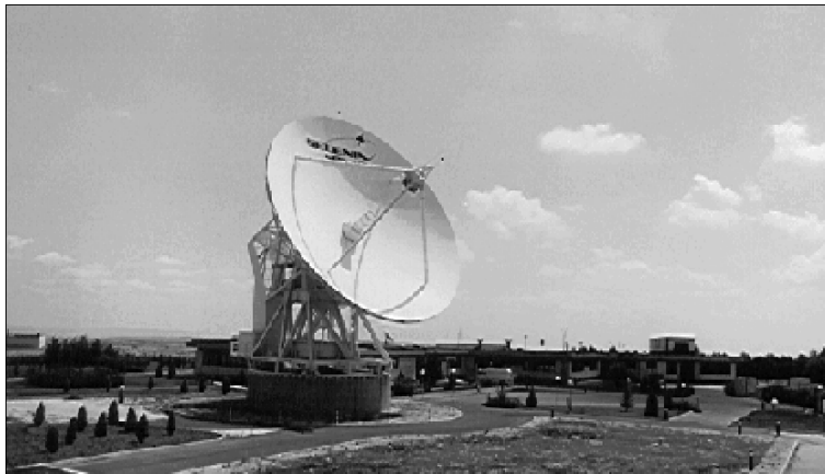
Figure 1. The Matera “Centro di Geodesia Spaziale” (CGS)

The Matera VLBI station is located at the Italian Space Agency “Centro di Geodesia Spaziale” (CGS) near Matera, a small town in the South of Italy.