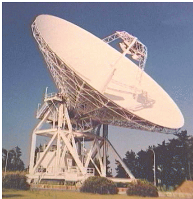
a. Image of 34m

Communications Research Laboratory (CRL) constructed the Kashima 34m telescope in 1988. Since the operation started, 12 years have passed. The telescope is kept in a good condition and joined various VLBI observations continuously. The Kashima Space Research Center of CRL was founded in 1964 near the Pacific ocean and is located 100 km east of Tokyo. The 34m telescope shown in the figure is currently operated by Radio Astronomy Applications Group. The telescope structure below the alidade section is almost identical to NASA DSN 34m stations, but the equipped frequency range, feed and electronics are different.