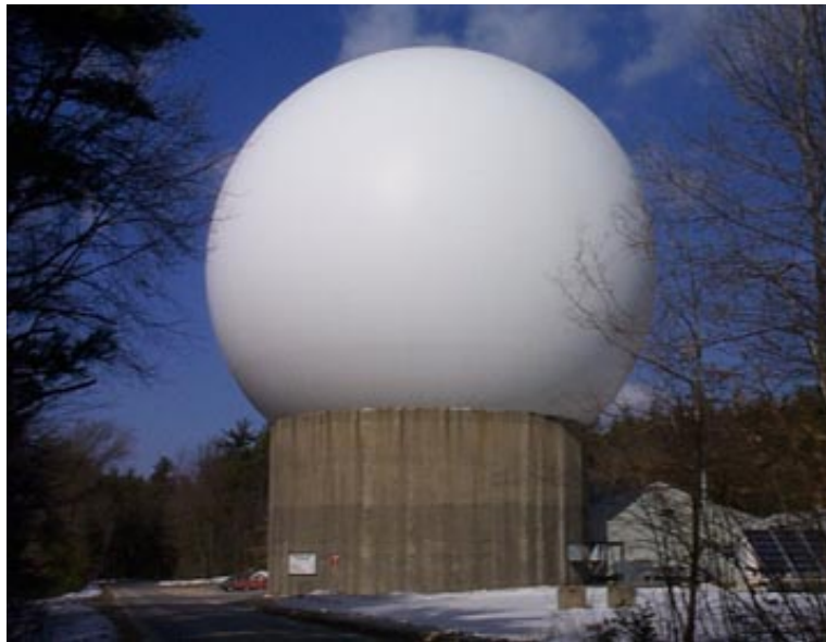
Figure 1. The radome of the Westford Antenna.

Since 1981 the Westford antenna has been one of the primary geodetic VLBI sites in the world. Located \sim 70 km northwest of Boston, Massachusetts, the antenna is part of the MIT Haystack Observatory complex.