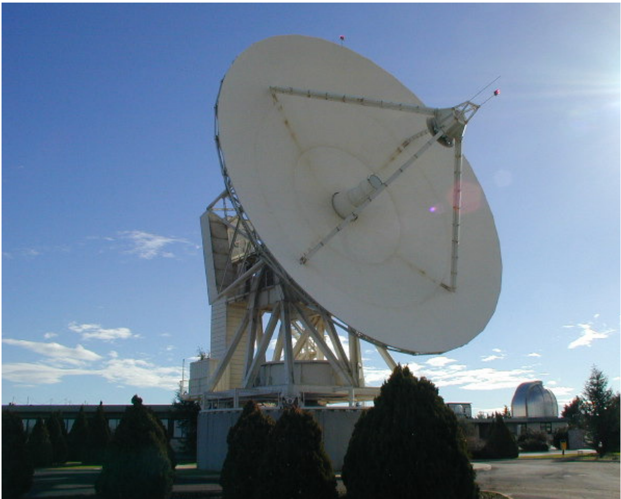
Figure 1. The Matera "Centro di Geodesia Spaziale" (CGS).

The Matera VLBI station is located at the Italian Space Agency's 'Centro di Geodesia Spaziale G. Colombo' (CGS) near Matera, a small town in the South of Italy. The CGS came into operation