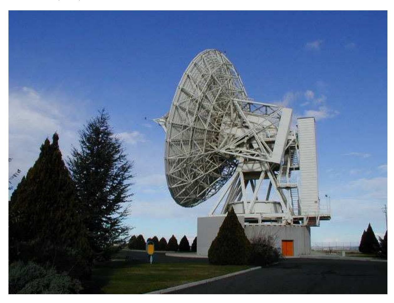
Figure 1. The Matera "Centro di Geodesia Spaziale" (CGS).

The Matera VLBI station is located at the Italian Space Agency's 'Centro di Geodesia Spaziale G. Colombo' (CGS) near Matera, a small town in the South of Italy. The CGS came into operation