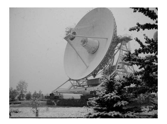
Figure 1. Zelenchukskaya Observatory.

The basic instruments of the observatory are a 32-m radio telescope and technical systems for doing VLBI observations.