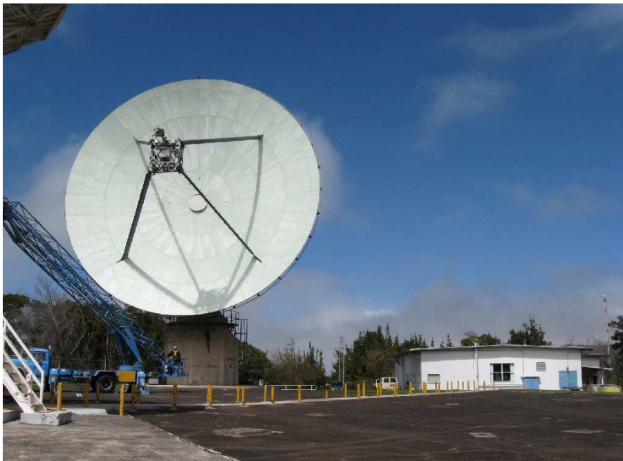
Figure 1. KPGO 20 m and operations building.

Koike Park Geophysical Observatory (KPGO) is located in the Koike State Park on the island of Kauai in Hawaii at an elevation of 1,100 meters near the Waimea Canyon, often referred to as the Grand Canyon of the Pacific.