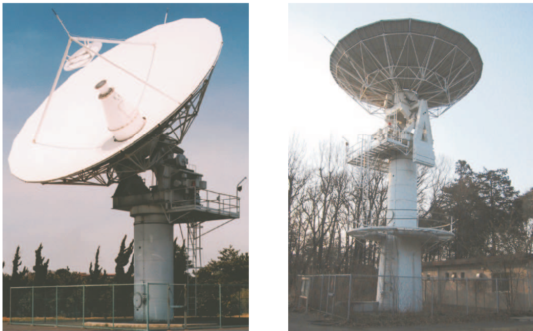
Figure 1. 11-m VLBI antennas at Kashima (left) and Koganei (right).

Two 11-m VLBI antennas at Kashima and Koganei (Figure 1) used to be stations of the Key Stone Project (KSP) VLBI Network. The network consisted of four VLBI stations at Kashima, Koganei, Miura, and Tateyama (Figure 2). These 11-m antennas and other VLBI facilities at the Miura and Tateyama stations have been transported to the Tomakomai Experimental Forest of the Hokkaido University and to the campus of Gifu University, respectively. As a consequence, two 11-m stations at Kashima and Koganei remain as IVS Network Stations. The KSP was a research and development project of the National Institute of Information and Communications Technology (NICT, formerly Communications Research Laboratory) [1]. After the regular VLBI sessions with the KSP VLBI Network terminated in 2001, the 11-m VLBI stations at Kashima and Koganei have mainly been used for the purposes of technical developments and miscellaneous observations.