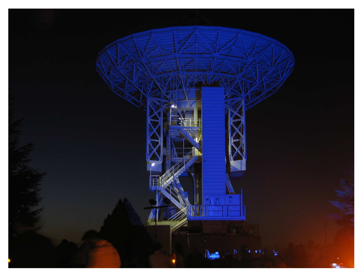
Figure 1. The Matera "Centro di Geodesia Spaziale" (CGS).

The Matera VLBI station is located at the Italian Space Agency's 'Centro di Geodesia Spaziale G. Colombo' (CGS) near Matera, a small town in the south of Italy. The CGS came into operation in 1983 when the Satellite Laser Ranging SAO-1 System was installed at CGS. Fully integrated into the worldwide network, SAO-1 was in continuous operation from 1983 up to 2000, providing high precision ranging observations of several satellites. The new Matera Laser Ranging Observatory (MLRO), one of the most advanced Satellite and Lunar Laser Ranging facilities in the world, was