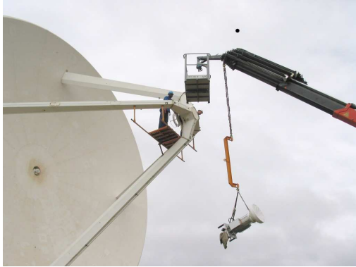
Figure 2. 15-m XDM's S/X receiver package being hoisted into position for prime-focus installation.