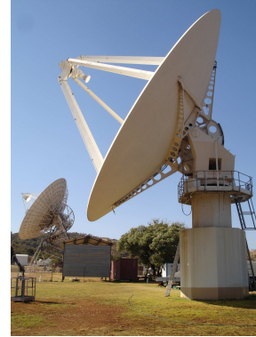
Figure 3. The 15-m, with cryogenically cooled receiver, co-observing radio galaxy 3C123 together with the 26-m.