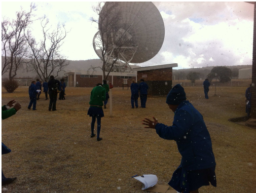
Figure 4. On August 7, these visitors enjoyed the first snow at HartRAO since the NASA days in the 1960s.