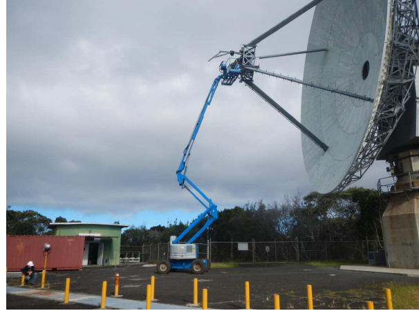
Figure 2. LNA repair.