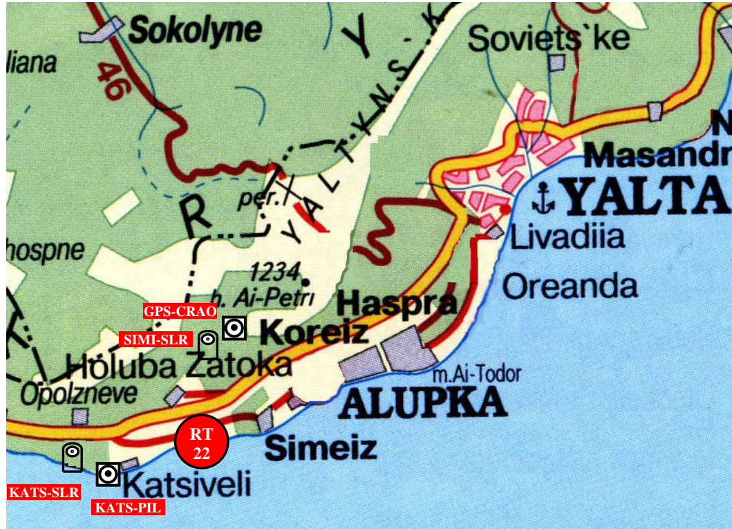
Figure 2. The geodynamics area “Simeiz-Katsiveli”.

RT-22, the 22-meter radio telescope which was set in operation in 1966, is among the five most efficient telescopes in the world. Various observations in the centimeter and millimeter wave ranges are being performed with this telescope now and will be performed in the near future. First VLBI observations were performed in 1969 on the Simeiz (RT-22) — Green Bank (RT-43, USA) intercontinental baseline. RT-22 is equipped with radiometers at the 92 cm, 18 cm, 13 cm, 6 cm, 3.5 cm, 2.8 cm, 2.3 cm, 2.0 cm, 13.5 mm, and 8 mm wavelengths.