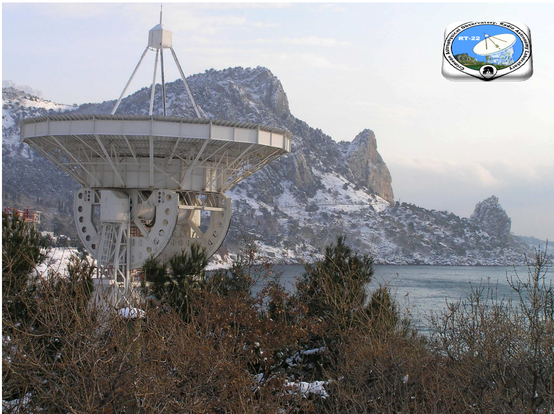
Figure 1. Simeiz VLBI station.

The Simeiz VLBI Station (also known as CRIMEA in the geodetic community), operated by Radio Astronomy Laboratory of Crimean Astrophysical Observatory, is situated on the coast of the Black Sea near the village Simeiz, 20 km west of the city Yalta in the Ukraine (Figure 1).