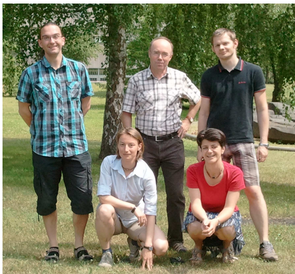
Fig. 2 IVS combination and IERS group at BKG in Frankfurt.