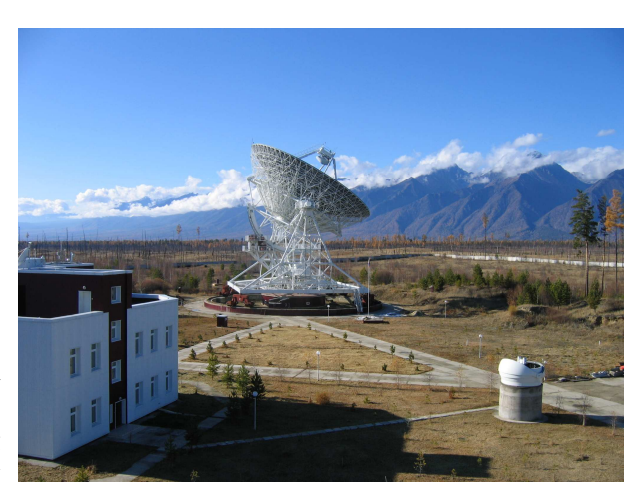
Fig. 1 Badary observatory.