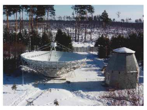
Fig. 6 Main reflector 13.2-m and antenna tower.