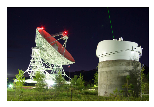
Fig. 3 "Sazhen-TM" SLR system at Badary observatory observed 1278 passes of Lageos, GLONASS et al. and obtained 11430 normal dots.

tion participated in 31 diurnal IVS sessions — IVS-R4, IVS-T2, and EURO.