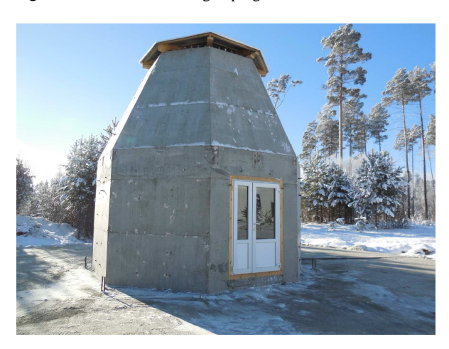
Fig. 5 Antenna tower for 13.2-m dish.