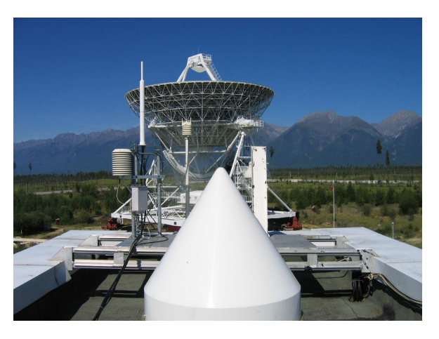
Fig. 2 Javad GPS/GLONASS/Galileo receiver and beacon "DORIS" at the Badary observatory.

Badary observatory participates in IVS and domestic VLBI observing programs. During 2013, Badary sta-