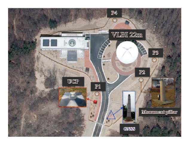
Fig. 1 Layout of the VLBI 22-m antenna, monument pillars 1 to 4, GNSS and UCP (Unified Control Point).