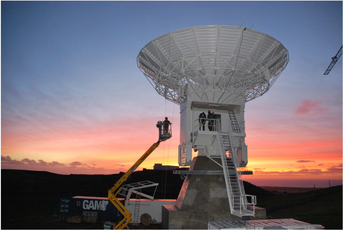
Fig. 3 Status of construction of the RAEGE antenna in Santa Maria (Azores islands, Portugal).