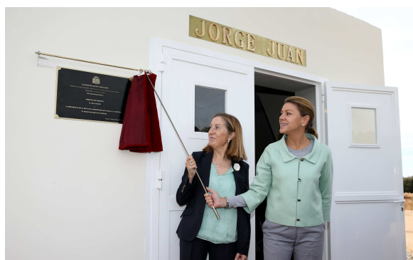
Fig. 2 Bronze dedication plaque for the RAEGE “Jorge Juan” radio telescope, unveiled on October 21, 2013 by the Spanish Minister of Development, D a Ana Pastor, and the President of the Autonomous Regional Government of Castilla-La Mancha, D a María Dolores de Cospedal.

It will be shortly followed by the antenna in Santa María (Azores, see the status of the onsite works in Figure 3 and the control building in Figure 4), whose first light is expected in early 2015.