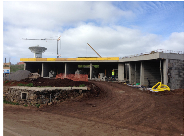
Fig. 4 Status of construction of the control and auxiliary buildings of the RAEGE station in Santa Maria.

tics for the S (2 GHz), X (8 GHz), and Ka (32 GHz) frequency bands (see Figure 5). This receiver will be installed at the Yebes RAEGE telescope, which is expected to become available for the IVS in the first half of 2014. An identical receiver was built for GSI