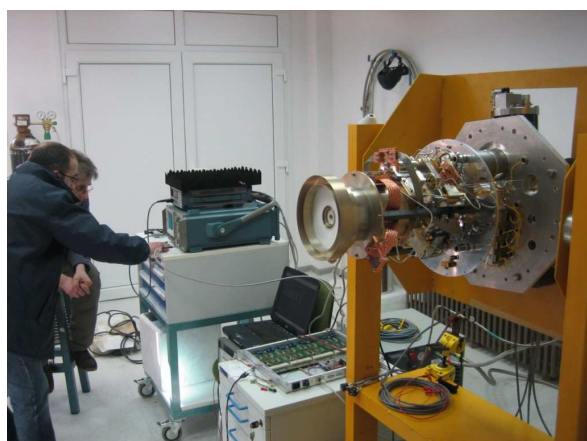
Fig. 5 Tri-band (S/X/Ka) receiver, designed and built at the laboratories in Yebes Observatory.

In order to comply with the VGOS specifications, a new broadband receiver is being developed at Yebes and should be available for observations in 2015.