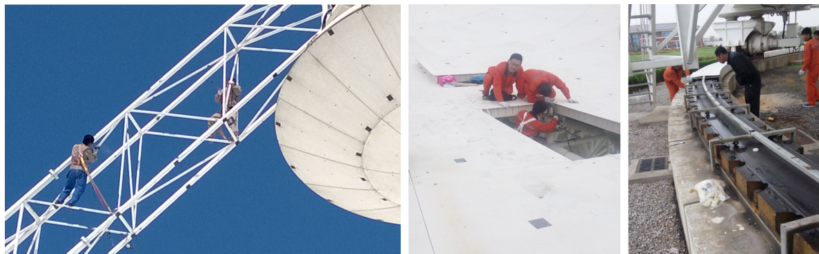
Fig. 2 Antenna maintenance of the Tianma 65-m telescope.