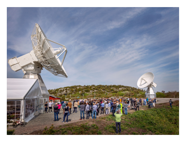
Fig. 1 The inauguration of the Onsala twin telescopes was held on 18 May 2017.

Observatory. At Onsala retired colleagues that participated in the first experiment were invited (see Figure 2). Bert Hansson gave a lecture, describing both the extensive preparations as well as the execution of this first experiment.