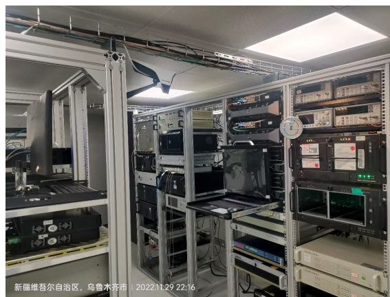
Fig. 3 The digital backend systems for VLBI and single dish operations, working in the walk-in electromagnetic shielding box under the telescope base.

hours, including 215 hours for the EVN-FRB program. In 2022, 276 VLBI experiments were conducted for all the VLBI networks mentioned above, and the total ef-