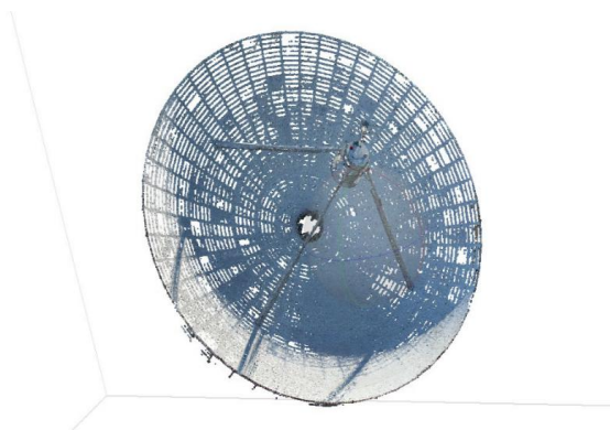
Fig. 2 Filtered dense point cloud at 65° elevation of the RT40-m main reflector, secondary mirror, and support legs.

to perform the local-tie survey between the RAEGE VLBI and RAEGE GNSS techniques.