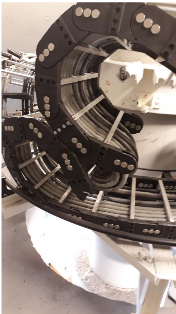
Fig. 3 Detail of the cable wrap structure breakage.

about ten meters tall, 150 m NW from the 13-m telescope and 270 m W from the 40 m. Time synchronization is provided by a CNS Clock II system, and a secondary GPS receiver from Microsemi is operated as a backup.