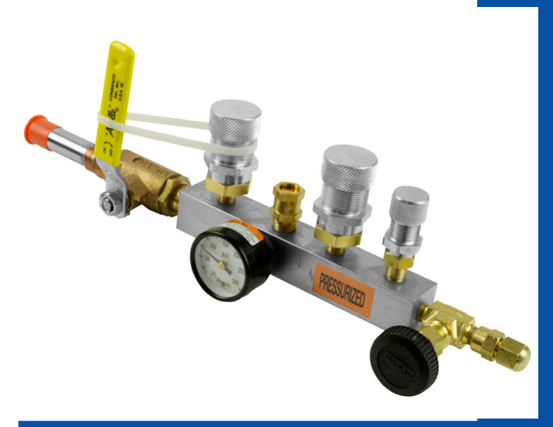
Picture of a helium maintenance manifold. The fill from the helium bottle is on the right, the purge to atmosphere is on the left, and the supply and the return helium lines attach to the two large connectors on the top side.

Spring has not quite sprung in the northeast United States, but already some days have reached 20°C. During this time of the year we always experience some warming in the cryogenic system, as the ambient temperatures and sun loads increase from winter. With the older Model 22 refrigerator, it may be the time to change the cold head. But with the new Model 350, we can see 18, 24, or even a bit more months of use before failure. So, in the springtime we purge contaminants from the system. This involves starting with a cold system, turning off the cryo compressor, and immediately disconnecting the supply and return lines from the back of the compressor. We connect these lines to a helium maintenance manifold, which allows us to fill the cold head from a supply bottle of Ultra High Purity helium, and also allows us to purge to atmosphere. We then warm the system to ambient and flush the cold head by first purging the helium from the supply and return lines and the cold head, filling the manifold, lines, and cold head from the supply bottle, and then operating the cold head at between 195 and 205 PSI for 10-30 seconds. This process is repeated five times in total. The procedure clears the formerly frozen contamination from the cold head, hopefully giving you a worry-free summer of operations!