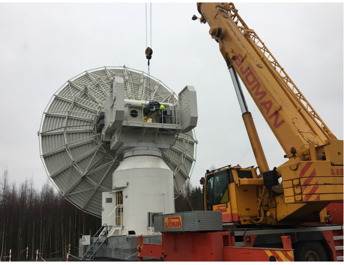
Installing the broadband receiver on the VGOS telescope on 22 November 2019.

For this purpose, two GNSS antennas were installed on the sides of the telescope dish in March. A series of local tie measurements, including the telescope reference point, are planned for this year. Testing is under way of the telescope system including the receiver as well as the integration of the signal chain components.