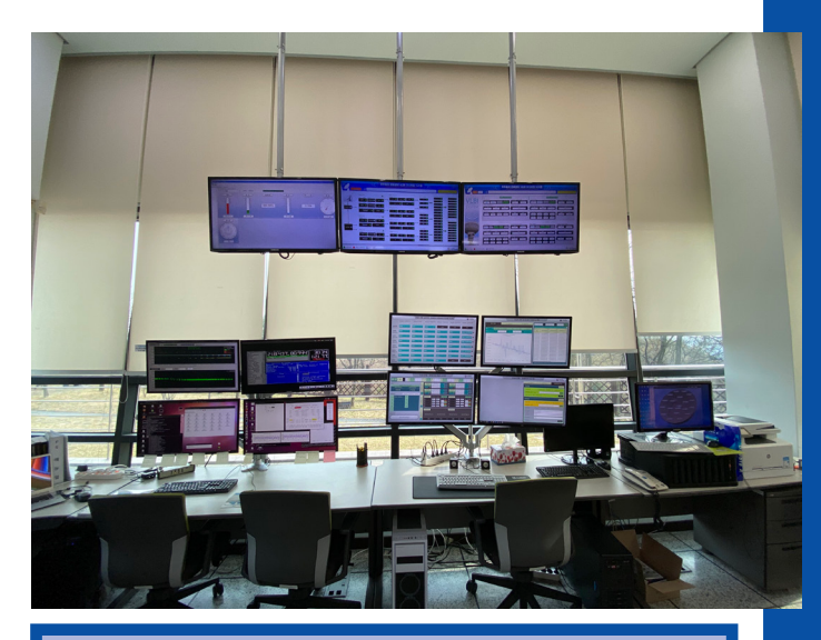
Inside the observation control room of Sejong VLBI Observatory showcasing the installed monitoring and control systems.

I enjoy fishing in the quiet at a tranquil river or doing weight training for my health. However, I have three sons: my oldest is six years old and loves insects and animals, then I have four-year-old twins who are indescribably adorable. So, I think, I will spend all my free time with my family until they grow up. That aside, I would like to extend my gratitude to everyone in the field of VLBI at home and abroad, as without them I would not be able to do this peaceful and amazing work. The Sejong VLBI Station and I have received technical assistance from VLBI experts from a number of different countries. I would like to especially thank the Kashima VLBI Group (particularly Dr. Kondo) and the members of the NASA/GSFC Group (John, David, Sergei, and others).