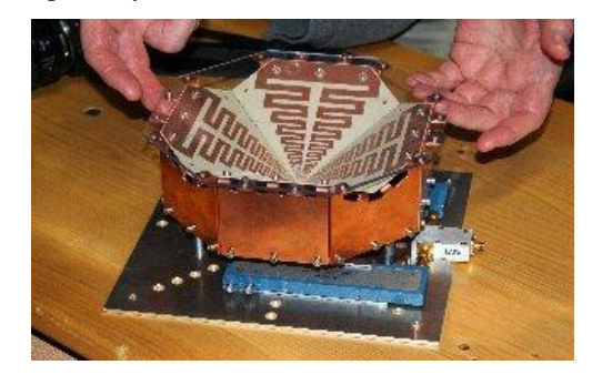
Fig. 4. Prototype of a broadband 2-14 GHz "Eleven" feed for VLBI2010. The feed is being developed at Chalmers University in Sweden.

Beyond the NASA development effort, organizations in other countries are involved in system developments potentially applicable to VLBI2010. These include Australia, China, Finland, Germany, Italy, Japan, Norway, Sweden (Fig. 4), and possibly others.