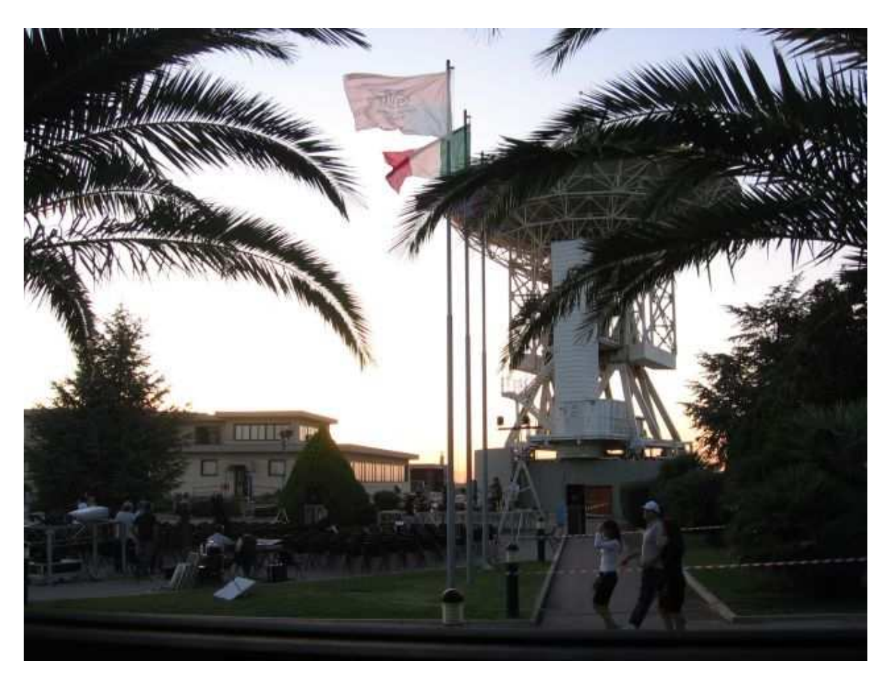
Figure 1. The Matera "Centro di Geodesia Spaziale" (CGS).

The Matera VLBI station is located at the Italian Space Agency's 'Centro di Geodesia Spaziale G. Colombo' (CGS) near Matera, a small town in the south of Italy. The CGS came into operation in 1983 when the Satellite Laser Ranging SAO-1 System was installed at CGS. Fully integrated into the worldwide network, SAO-1 was in continuous operation from 1983 up to 2000, providing high precision ranging observations of several satellites. The new Matera Laser Ranging Observatory (MLRO), one of the most advanced Satellite and Lunar Laser Ranging facilities in the world, was