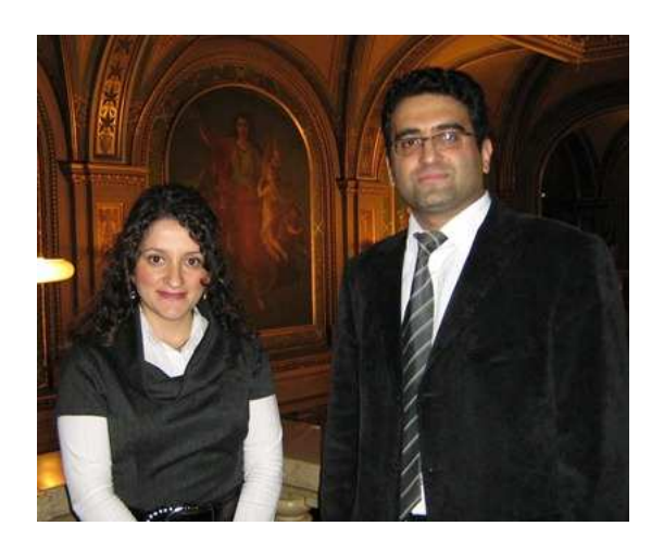
Figure 1. KTU-GEOD staff at Vienna State Opera.

The KTU-GEOD IVS Analysis Center (AC) is located at the Department of Geomatics Engineering, Karadeniz Technical University, Trabzon, Turkey.