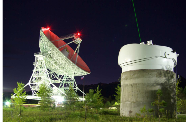
Figure 2. Javad GPS/GLONASS/Galileo receiver and DORIS beacon at the Badary observatory.