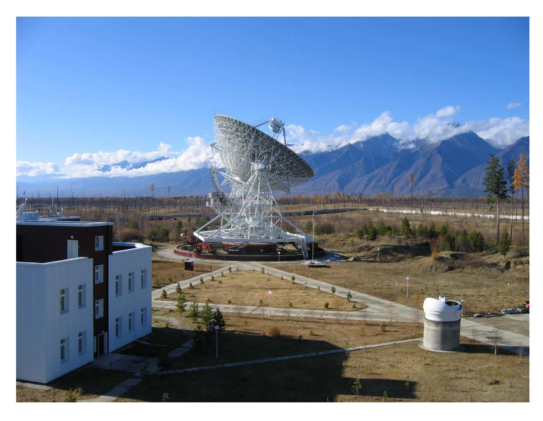
Figure 1. Badary observatory.

The sponsoring organization of the project is the Russian Academy of Sciences (RAS). The Badary Radio Astronomical Observatory is situated in the Republic Buryatia (East Siberia) about 130 km east of Baikal Lake (see Table 1). The geographic location of the observatory is shown on the IAA RAS Web site (http://www.ipa.nw.ru/PAGE/rusipa.htm). The main instruments of the observatory are the 32-m radio telescope equipped with special technical systems for VLBI observations, GPS/GLONASS/Galileo receivers, a DORIS antenna, and the SLR system.