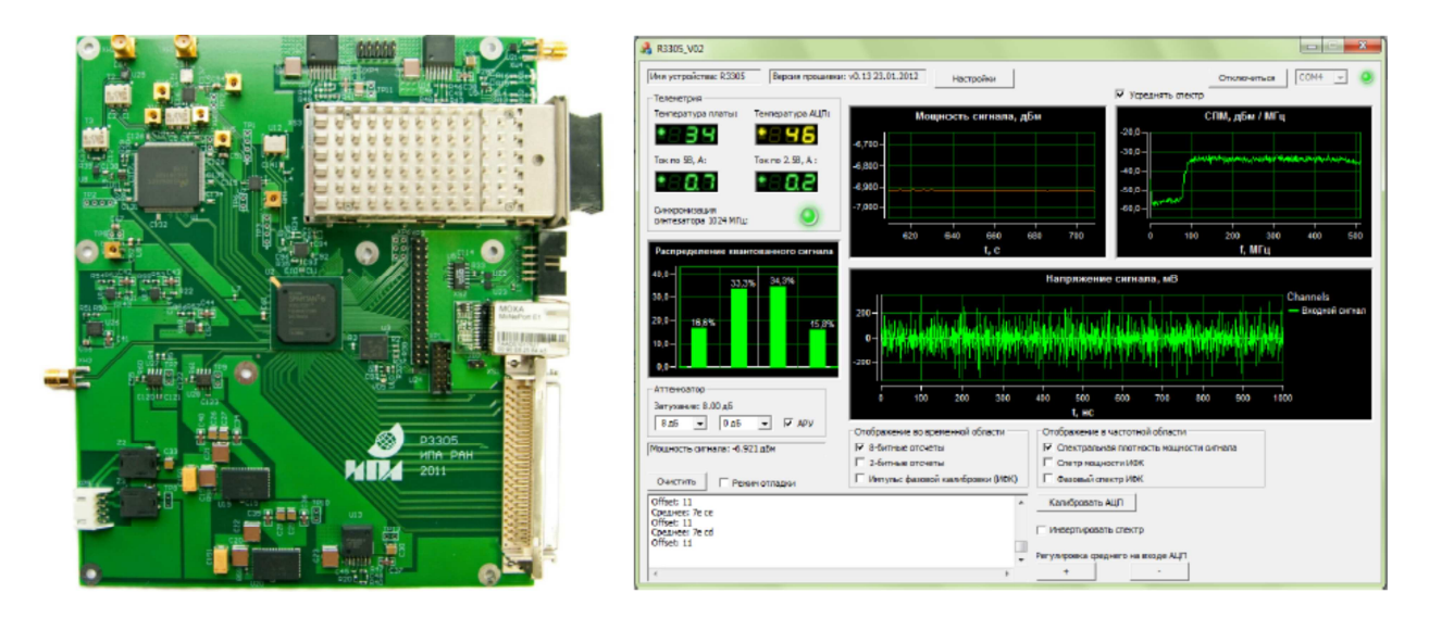
Figure 2. The single channel prototype of BRAS (left) and the interface of control software (right).

The modular design of BRAS provides convenience of operation. The special case with electromagnetic protection allows placement of this system directly on the antenna near to outputs of receivers. Two one-channel prototypes of BRAS have been made (see Figure 2). They have been placed in VLBI Network "Quasar" observatories and connected to IF outputs of usual receivers.