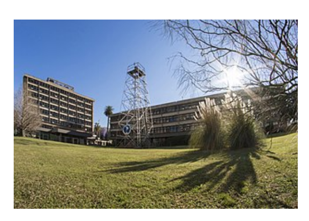
Fig. 1 National Geographic Institute of Argentina.

to different international services such as IVS, ILRS, and SIRGAS. The main activities of the IGN VLBI group consist of routine processing of 24-hour observational sessions to obtain an estimate of Earth Orientation Parameters (EOP), station coordinates, and station velocities, together with radio source positions.