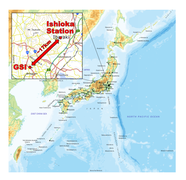
Fig. 2 Location of Ishioka station.

observation. It usually takes approximately one week for the adjustment.