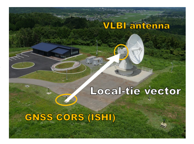
Fig. 3 VLBI-GNSS local-tie in Ishioka station.

We submitted the result of the local-tie surveys to IERS. Ishioka was registered as one of the IERS stations for the first time in 2021.