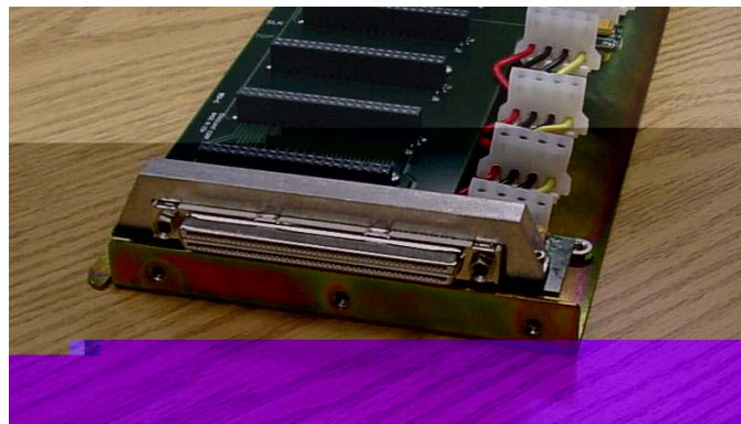
Figure 2: Connector clamp installed over 200-pin module backplane connector

An aluminum clamp has been designed to fit over the 200-pin connector on the module backplane to prevent flexing of the connector and to relieve stress on the solder joints (see Figure 2). Earlier modules did not have this clamp installed when purchased; these modules will be retrofitted with clamps when they are returned to a correlator 5 . Later modules have these clamps installed when purchased.