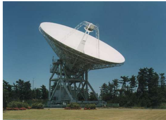
Figure 2. The Kashima 34m radio telescope.