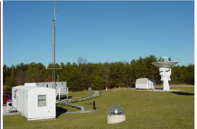
Figure 2. New permanent MV3 antenna.

GGAO is located on the east coast of the United States in Maryland. It is about 15 miles NNE of Washington D.C. in Greenbelt, Maryland (Table 1).