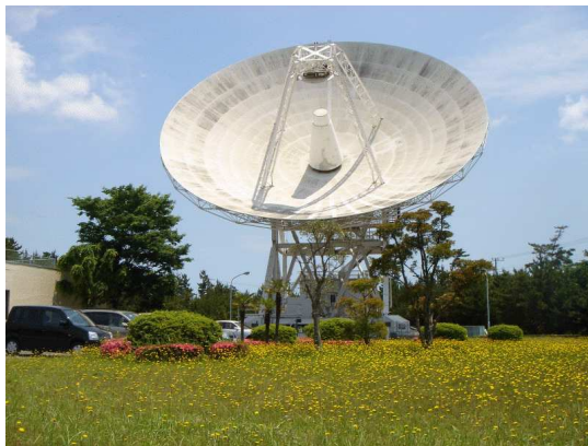
The Kashima 34-m radio telescope.

The Kashima 34-m radio telescope (Figure 1 left) was constructed as a main station of the “Western Pacific VLBI Network Project” in 1988. After that project’s termination, the telescope has been used not only for geodetic purposes but also for astronomy and other purposes. The station is located about 100 km east of Tokyo, Japan and co-located with the 11-m radio telescope and the International GNSS Service station (KSMV) (Figure 1 right). This station is maintained by the Space-Time Measurement Project of the Space-Time Standards Group of KSRC, NICT.