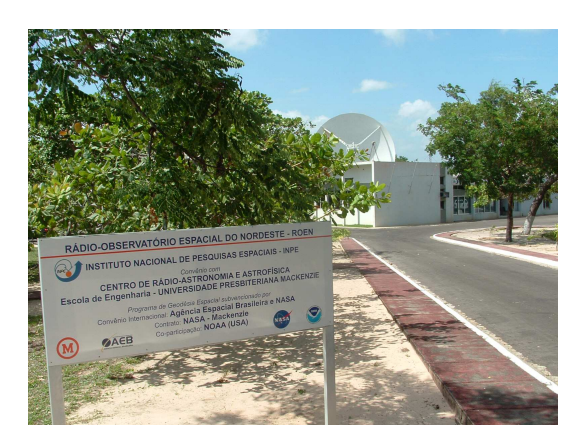
Figure 1. Main entrance of the Fortaleza station.