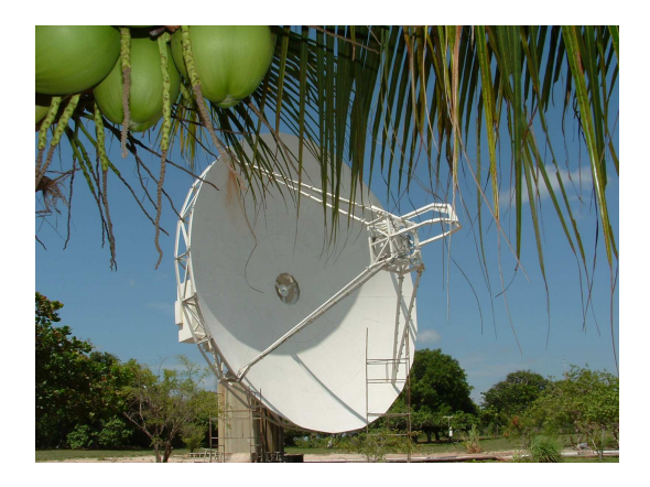
Figure 2. 14.2 m Fortaleza antenna taken under a coconut tree.