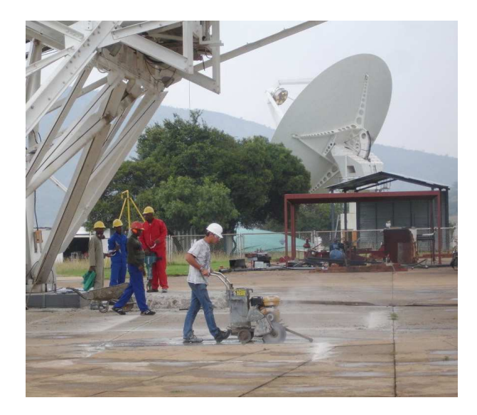
Figure 4. Groundbreaking: cutting the slab for the construction of the 26-m's A-frame support; in the background, the XDM is being put through its paces using the adapted 26-m observing scheduler.