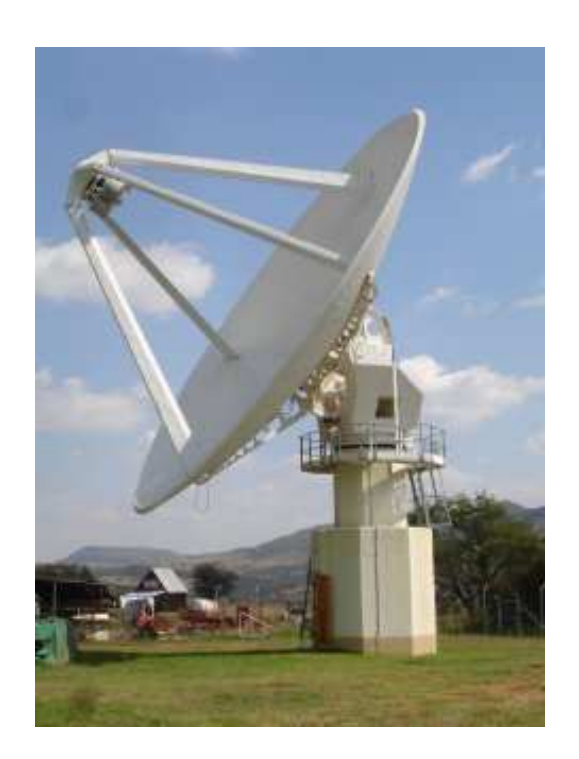
Figure 2. 15-m XDM: the KAT prototype is to be converted to a radio telescope capable of performing geodetic VLBI experiments.