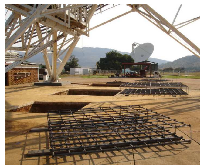
Figure 5. Rebars ready: steel reinforcing bars for the A-frame support's three concrete foundation slabs are ready to go into the ground.