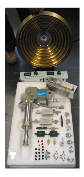
Figure 3. XDM feeds and receiver: prototype S-X feeds and components for the receiver.