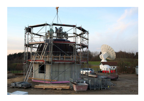
Figure 2. Construction of the concrete tower for the TWIN telescopes