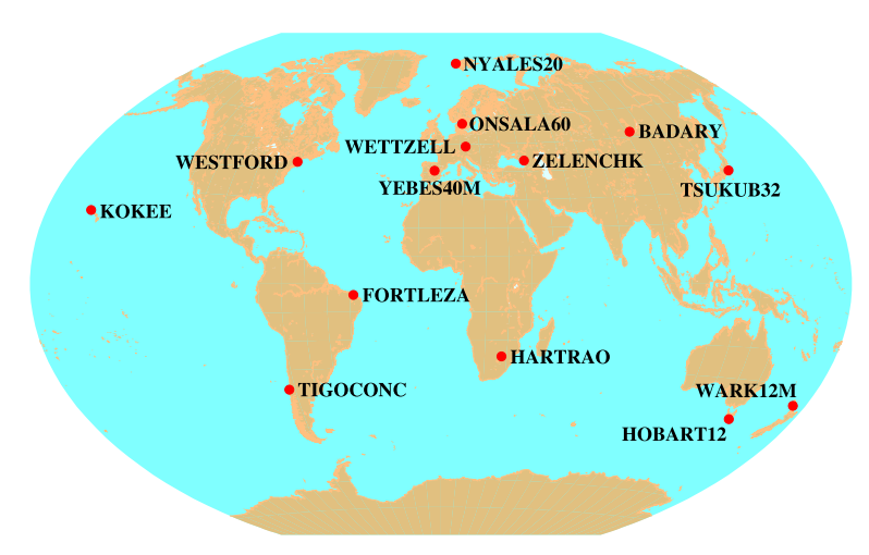
Figure 2. Geographical distribution of the 13 CONT11 stations. From the original 14 stations, Warkworth had to drop out because of technical problems.

in pre-CONT08 continuous campaigns (usually a 30-minute break between individual observing days) and resulted in unrealistic peaks in the sub-daily EOP time series derived from the CONT data.