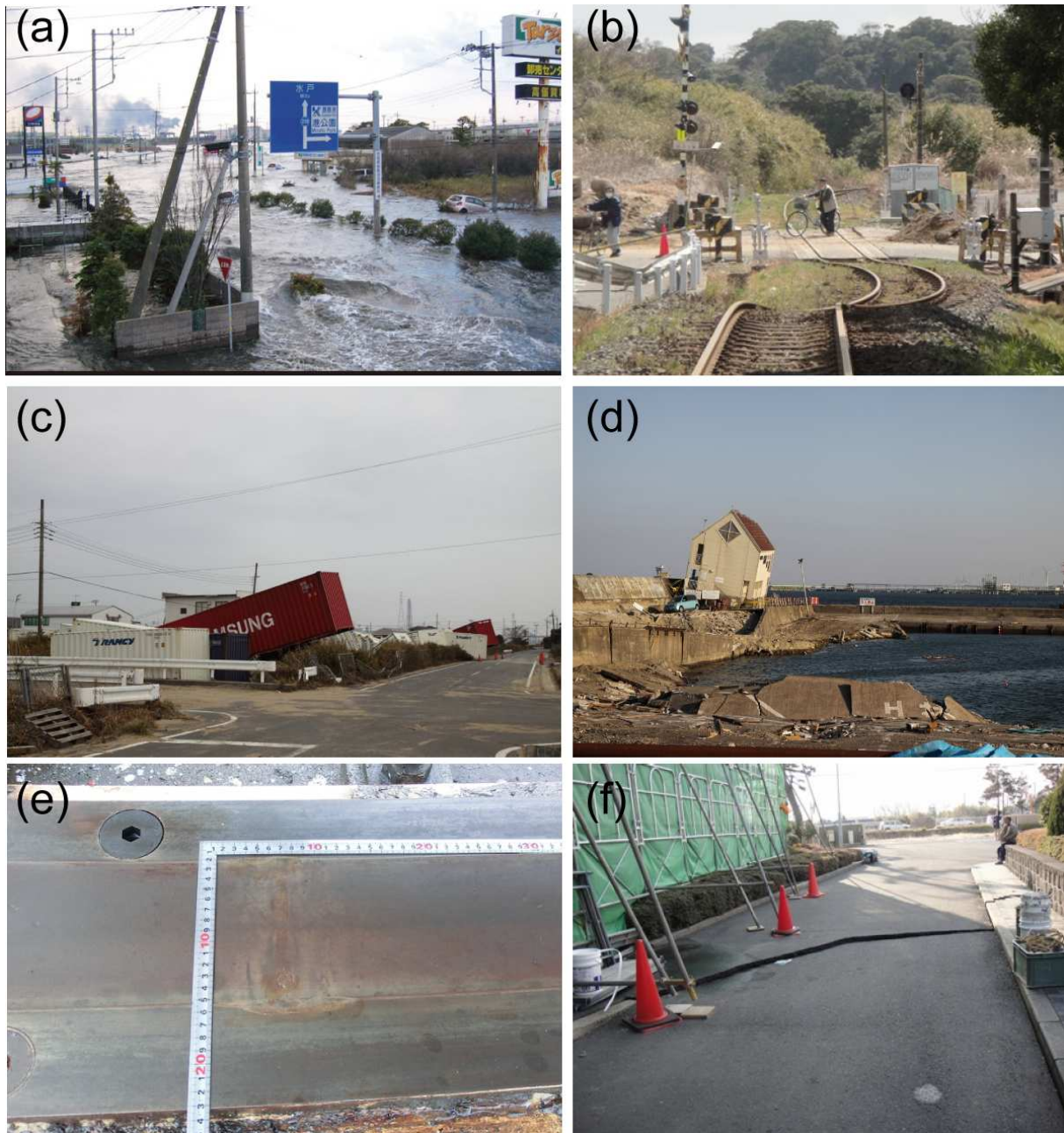
Figure 2. Earthquake damage in Kashima city. (a) A tsunami struck the Kashima port and surrounding area [2], (b) train rail bent by powerful ground motion, (c) cargo containers thrown around by the tsunami in Kashima, (d) Kashima port hit by the tsunami, (e) ripple mark of 34-m antenna azimuth rail caused by strong motion, (f) broken road in front of the KSRC/NICT main building.