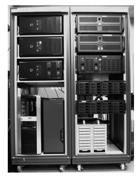
Fig. 3 Servers used for corelation processing.