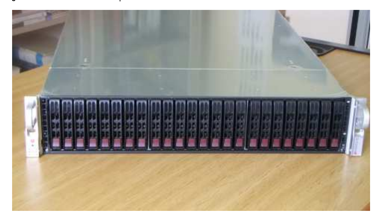
Fig. 2 FILA40G.