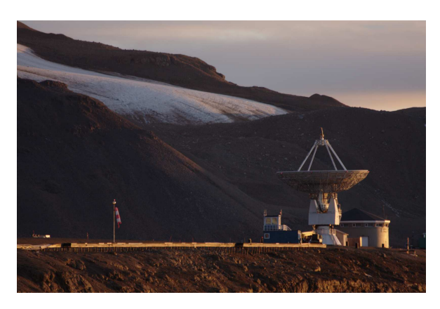
Fig. 1 Telescope seen from east.

of Volcanology and Geophysics (INGV). Another Real-Time Ionospheric Scintillation (RTIS) Monitor was set up by the NMA in November 2012.