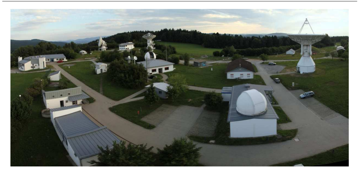
Fig. 2 A panorama view of the observatory with the 20-m RTW on the right and the two TWIN telescopes in the back.

of the servo system in 2013. Additionally, one azimuth and one elevation gear required a maintenance update within the warranty period, because of an oil leakage problem.