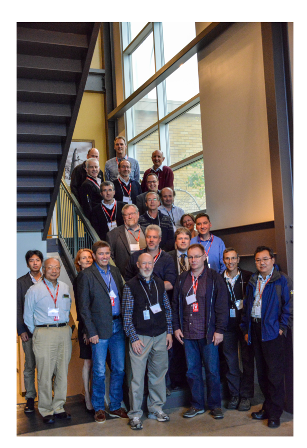
Fig. 3 Participants of the IVS Retreat in Penticton.

• IVS Retreat: Supported the organization of the IVS Retreat held at DRAO (Dominion Radio Astrophysical Observatory), Penticton, BC, Canada on October 7–8, 2015. The participants (IVS Directing Board plus six invited guests) discussed the current and future challenges for the IVS based on an evaluation of the current state. The resulting Strategic Plan 2016–2025 was posted on the IVS Web site and is also contained in the Proceedings volume of the ninth IVS General Meeting.