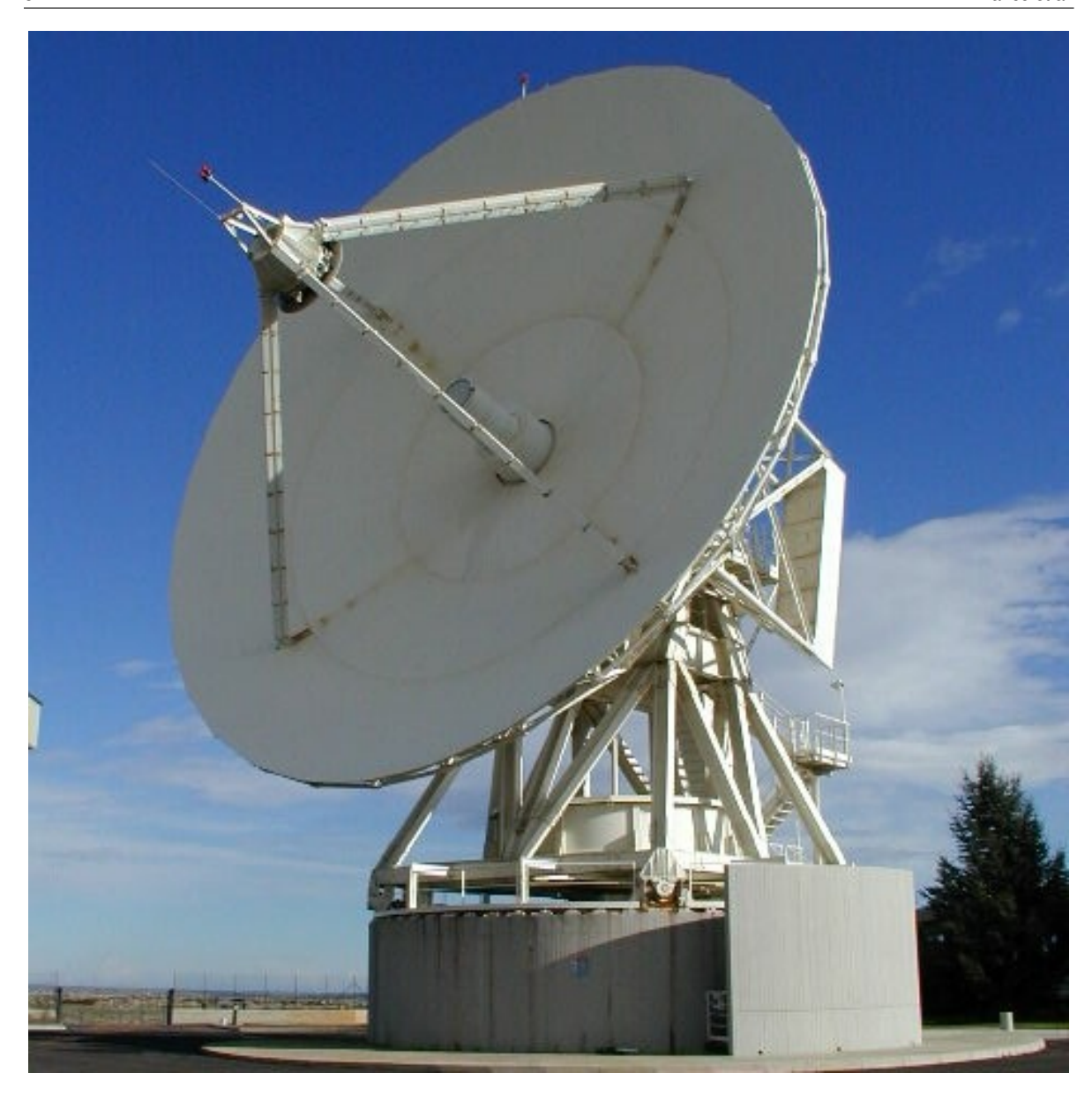
Fig. 1 VLBI antenna.