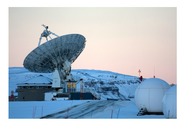
Fig. 1 Geodetic observatory, 20-m telescope, and the GFZ's satellite station.

other Real-Time Ionospheric Scintillation (RTIS) monitor was set up by the NMA in November 2012.