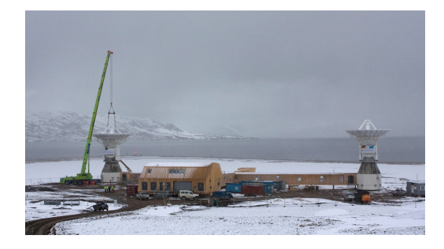
Fig. 6 Main reflector installation on the north telescope of the new observatory.

Due to limitations of the aviation authorities, the new telescopes could not be built close to the existing site (which is next to the airfield: the blue building in Figure 1 is the tower), but 2 km further out. Work on the station building lasted throughout 2015, and in 2016 the two MT Mechatronics 13.2-m telescopes were established.