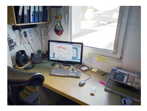
Fig. 4 Operator's desk with view on Field System screen and radio telescope.