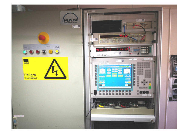
Fig. 5 Servo cabinet with antenna control unit inside the AGGO-2 VLBI operation container.