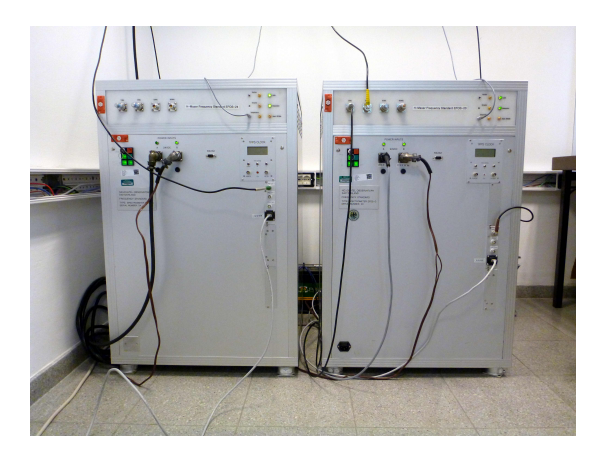
Fig. 6 VLBI reference H-maser EFOS-24 and EFOS-20 at the time & frequency laboratory of AGGO.