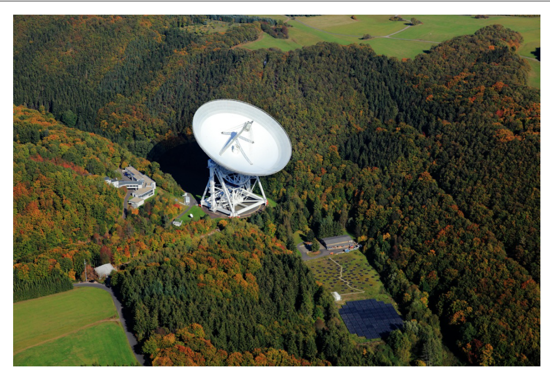
Fig. 1 Aerial image of the Effelsberg radio observatory. Shown are the 100-m Effelsberg antenna and the institute's building (left of the antenna). Effelsberg hosts also a station of the European Low Frequency Array (LOFAR), seen in the lower part of the picture.