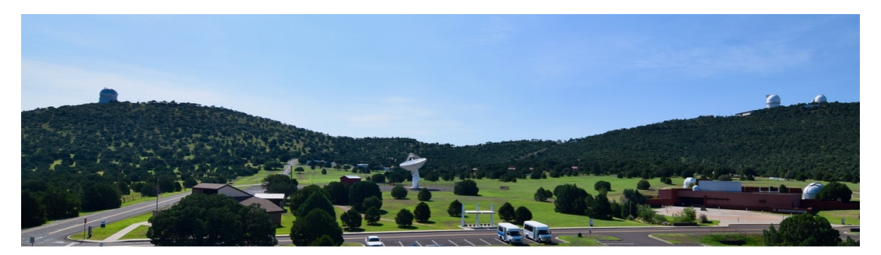
Fig. 2 MGO/McD site overview.

During the 2022 calendar year, MGO continued operations with both VGOS sessions and Intensives/tests with Wettzell South. The Wettzell Correlation Center had a fast turn-around for the Intensive and test sessions because MGO was able to e-transfer scans overnight utilizing our 1 Gb/s line, and correlation took place the following day. We also calibrated our onsite RF analyzers in order to better understand and troubleshoot our front-end signals with remote assistance from the MIT Haystack staff. MGO was also able to coordinate and install a live feed video camera system that broadcasts VLBI video to the public, utilizing the YouTube live feed feature. MGO also makes our onsite weather information publicly available, utilizing the Ambient Weather hardware and website. The website based on these features can be seen here: https://www.csr.utexas.edu/mgo/mgo-liveview-of-vlbi-station/.