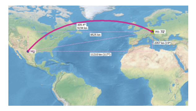
Fig. 2 VGOS Intensive baseline: McDonald (Mg) to Wettzell (Ws).

tensive session S22053. The formal error value of 4 \mu s for \Delta UT1 is within the expectation. In one hour, 91 scans were observed and no losses occurred during correlation. The analysis showed few outliers (3.2 %). The standard deviation of the group delays is at a level of 12 mm and comparable to other VGOS Intensive sessions.