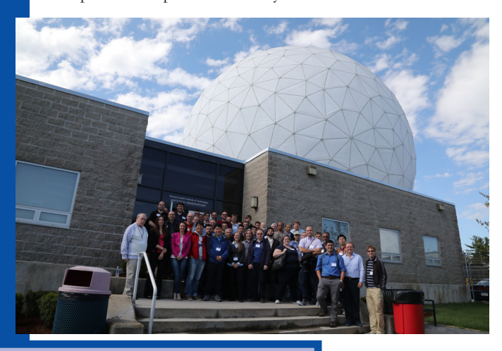
Attendees of the 9th IVS Technical Operations Workshop.

The 9th IVS Technical Operations Workshop (TOW) was held from Sunday, April 30 through Thursday, May 4, 2017 at MIT Haystack Observatory. This is an account of the personal experiences of my first TOW.