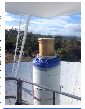
The Callisto VGOS receiver mounted with preliminary weather protection on the Hobart 12-m antenna.

After two years of testing and prototyping, in June 2017 three Callisto production receivers arrived at Hobart. It is now up to us to install them on the existing 12-m AuScope telescopes in Hobart, Katherine, and Yarragadee, replacing the existing S/X receivers. Our plan is to start with Hobart and follow with the two remote sites in 2018. While the Hobart receiver itself is already mounted (although with preliminary weather protection), final work on the antenna optics