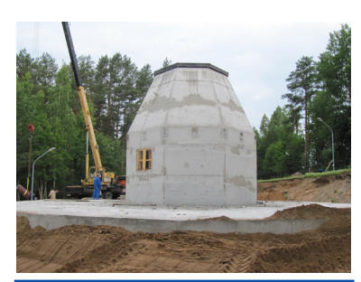
Foundation and antenna tower of the new radio telescope at the Svetloe Observatory.

In a state-sponsored modernization program, the Russian "Quasar" VLBI network is being augmented by fast rotating, 13.2-m class radio telescopes (RT13) with multi-band systems at the existing sites of the network. This will improve the accuracy, reliability, and effi-