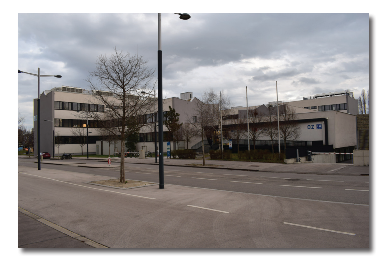
Building housing the Vienna Scientific Cluster (maybe not what you expected).

[JG] A good correlator needs a mix of skills in signal processing, IT, and specific VLBI knowledge. Correlation is a very specialized task that requires dedicated working time, an efficient team, and access to a computing cluster. An often overlooked, but critical skill is managing communication between the stations and the correlator. A VGOS session, for example, requires coordination with up to 13 stations simultaneously. It's not uncommon for a single session to generate over 80 emails! While we aim to be as efficient as possible, gathering raw data from around the world and resolving